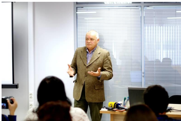
Dmitry Kiselev with Georgian Journalists

Well-known Georgian NGO Caucasian House is also engaged in active cooperation with the Gorchakov Foundation. In conjunction with the latter the organization has held quite a number of conferences between Russian and Georgian youth. The