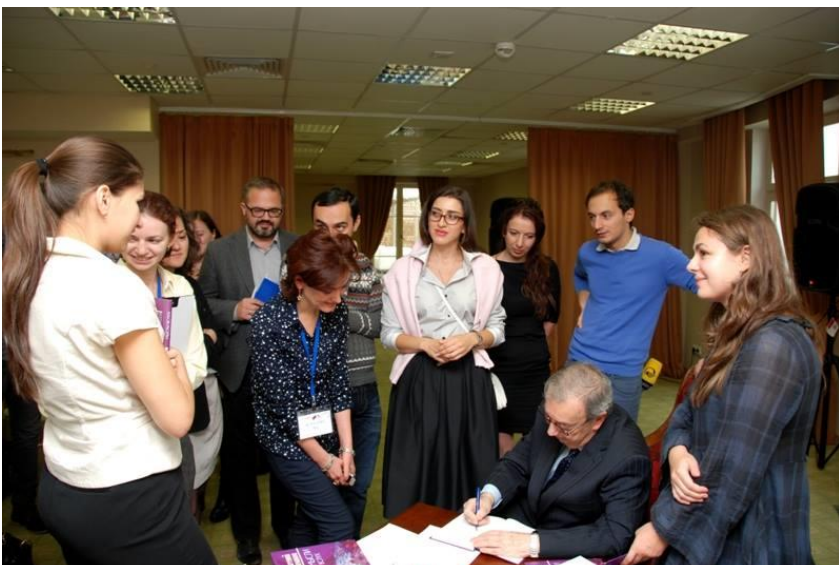
Georgian journalists with Evgeny Primakov

Khubutia , Russian Deputy Foreign Minister Grigory Karasin , former Russian PM Evgeny Primakov and the Patriarch of Russia Kirill 40 .