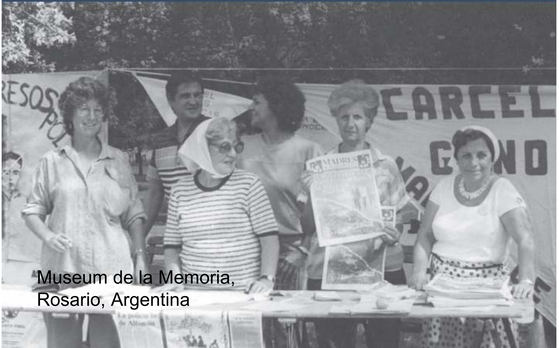
Museum de la Memoria, Rosario, Argentina

International Coalition of SITES of CONSCIENCE