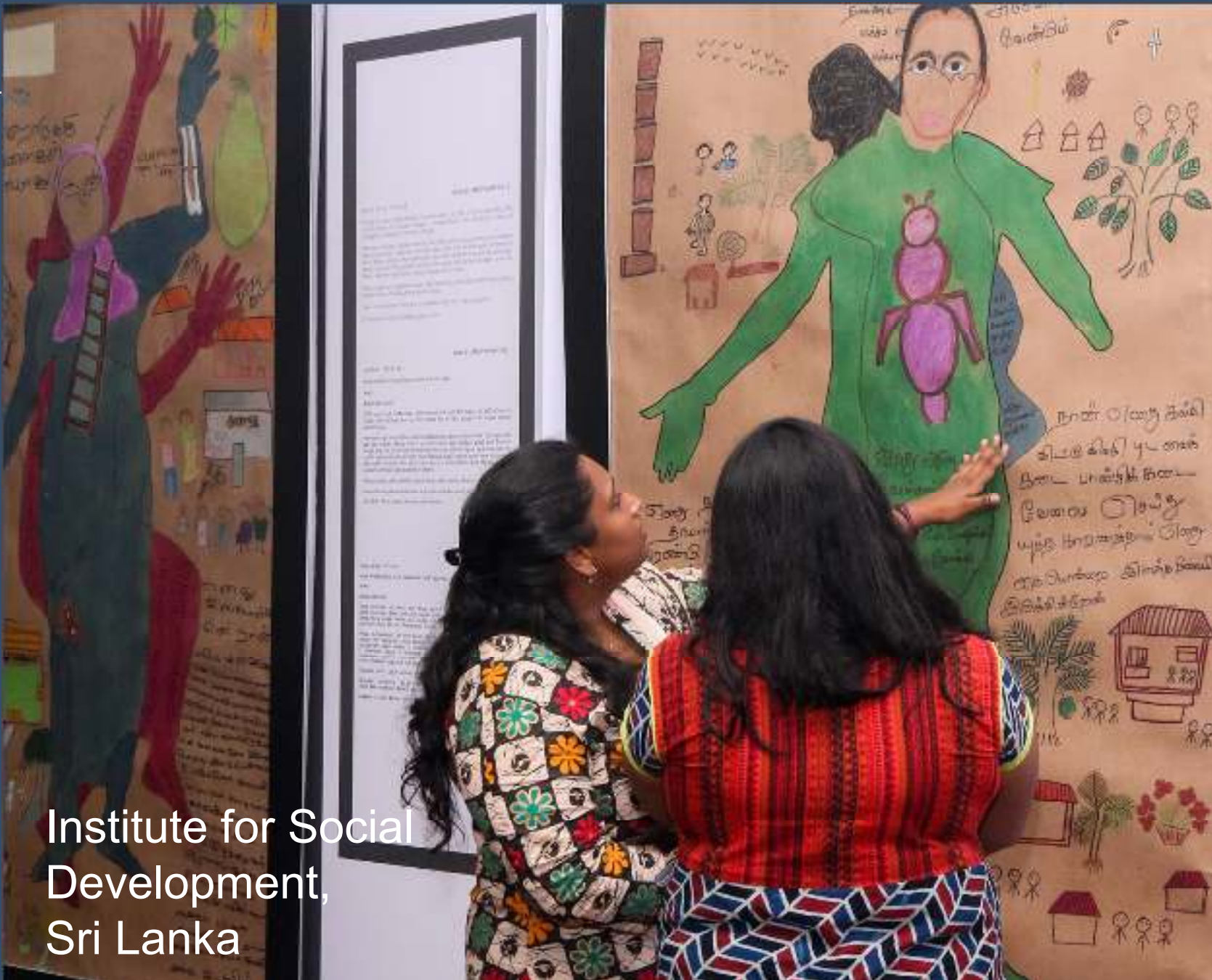
Institute for Social Development, Sri Lanka