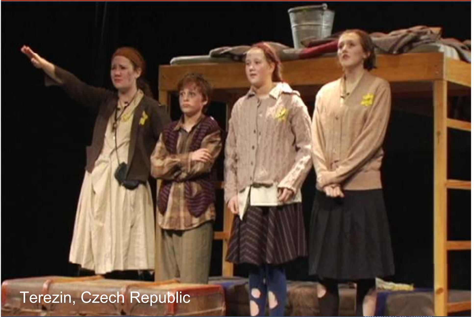
Terezin, Czech Republic