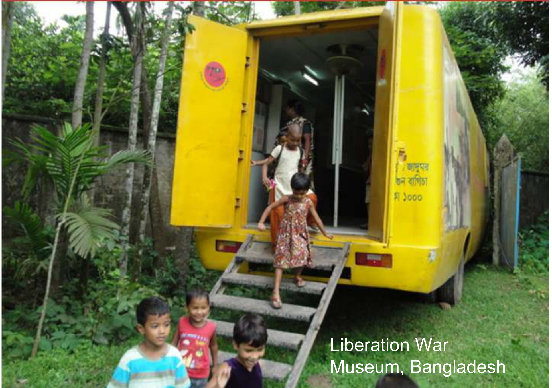
Liberation War Museum, Bangladesh