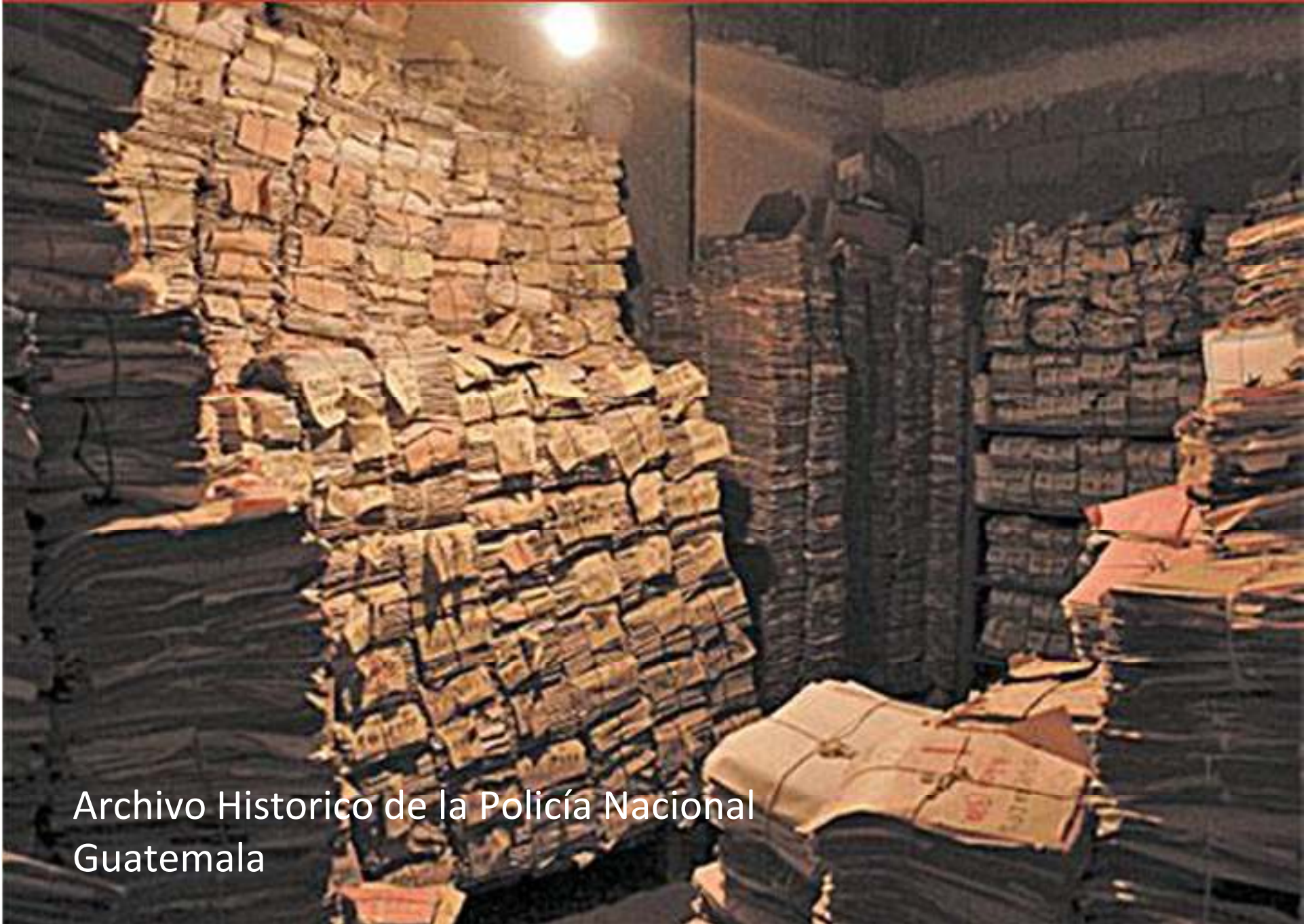
Archivo Historico de la Policía Nacional Guatemala