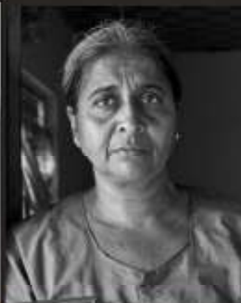
Ampara, Bataloa and Moneragala