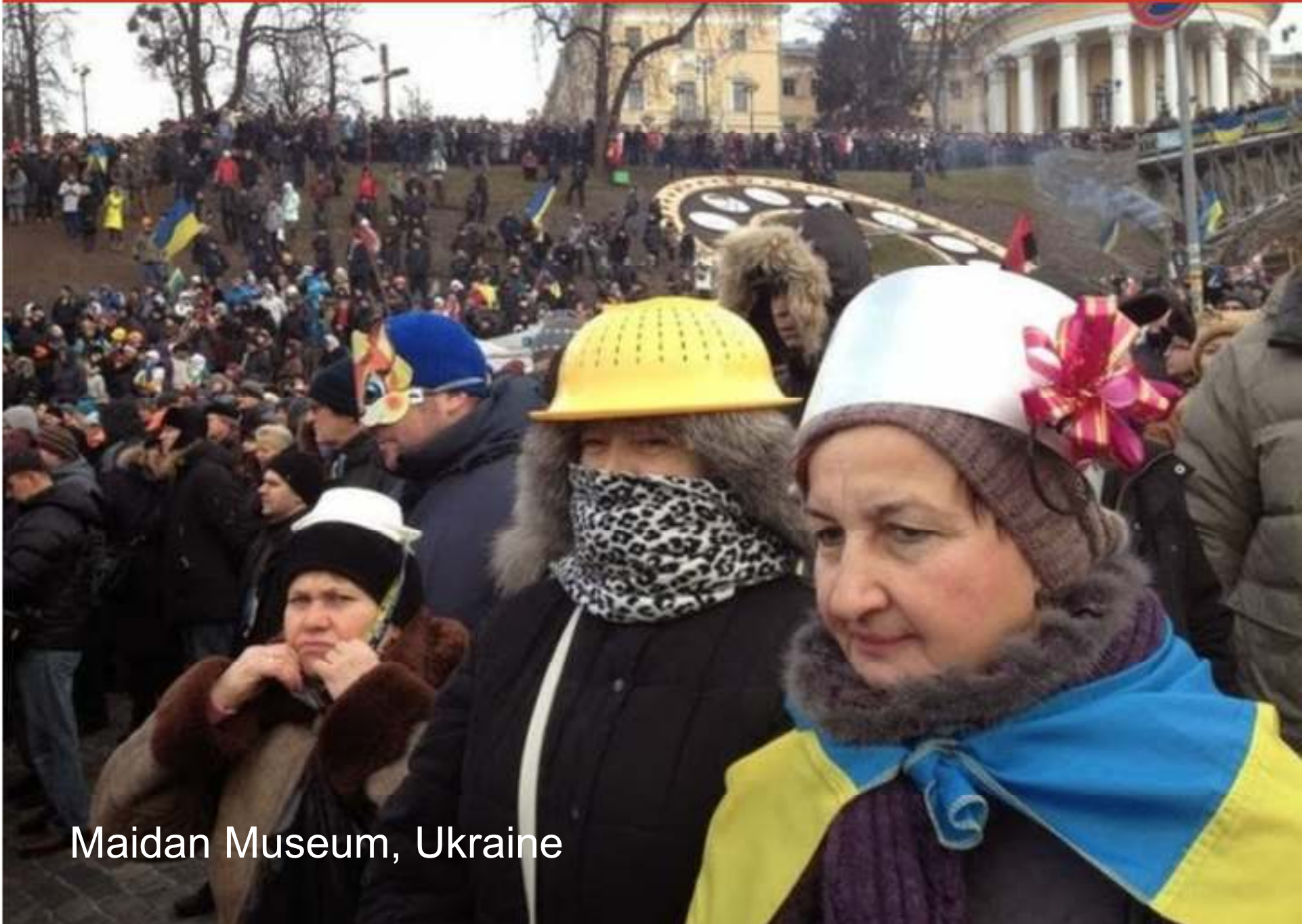
Maidan Museum, Ukraine