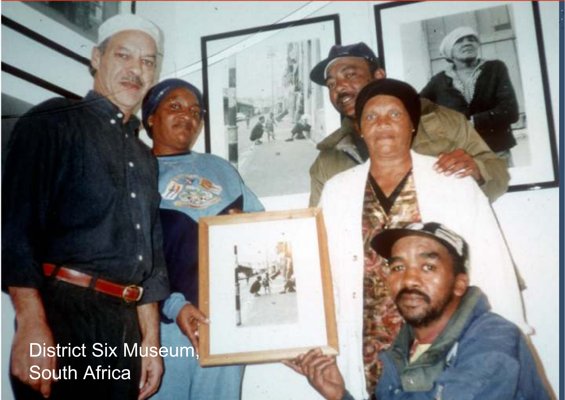
District Six Museum, South Africa