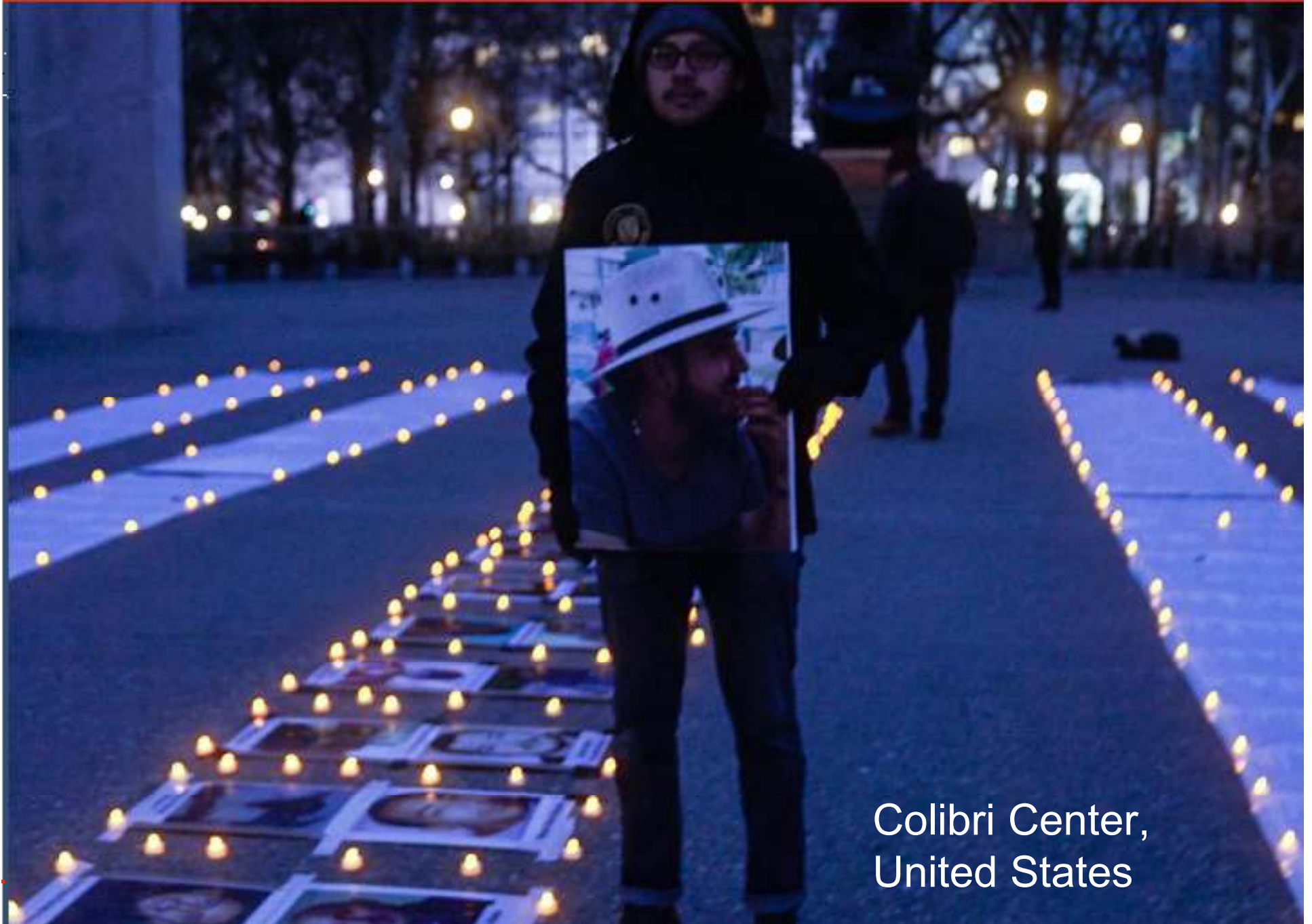
Colibri Center, United States