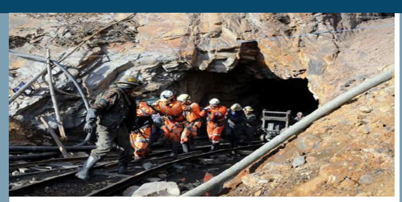
Extractive Industries Transparency Initiative as a Basis for Openness and Social Dialogue

INSTITUTE FOR DEVELOPMENT OF FREEDOM OF INFORMATION